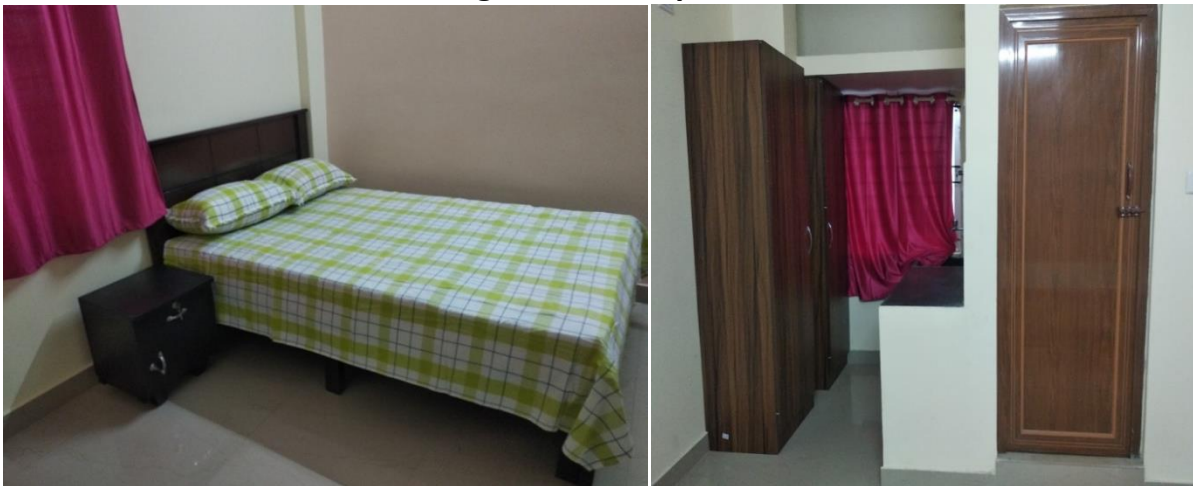
Single Room – Ordinary