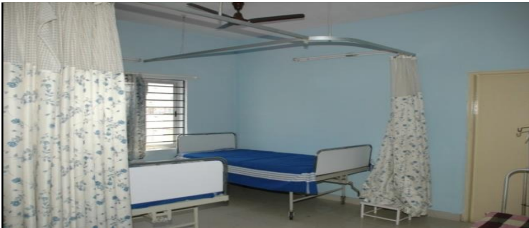
Twin Sharing Ward