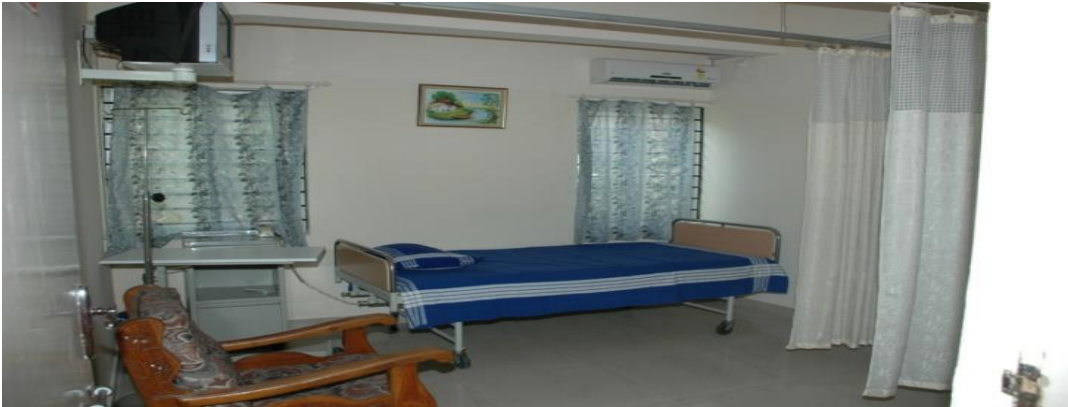
AC Deluxe Ward