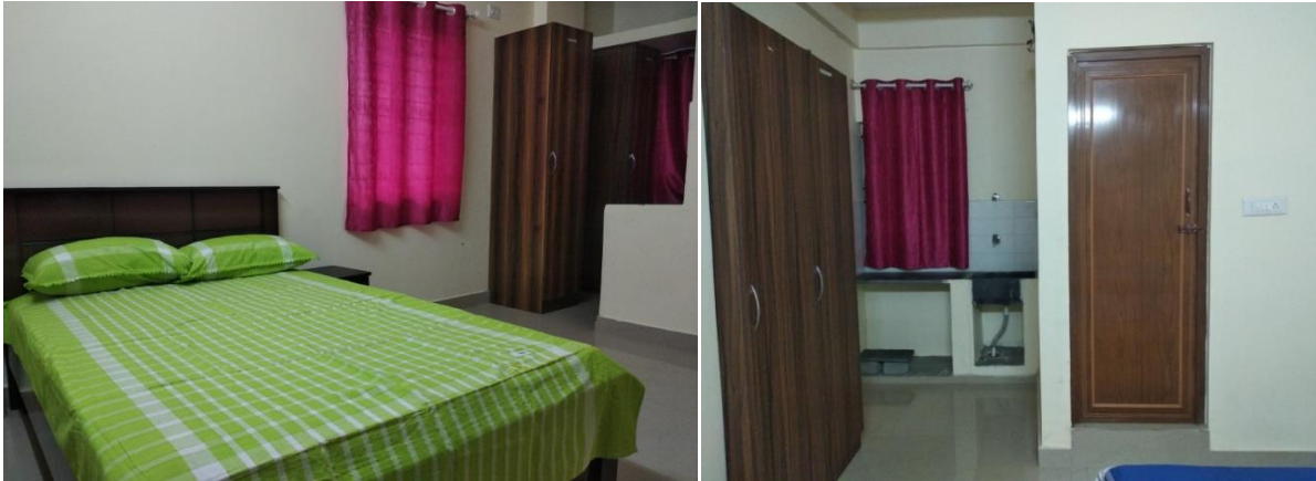
Single Room – Special