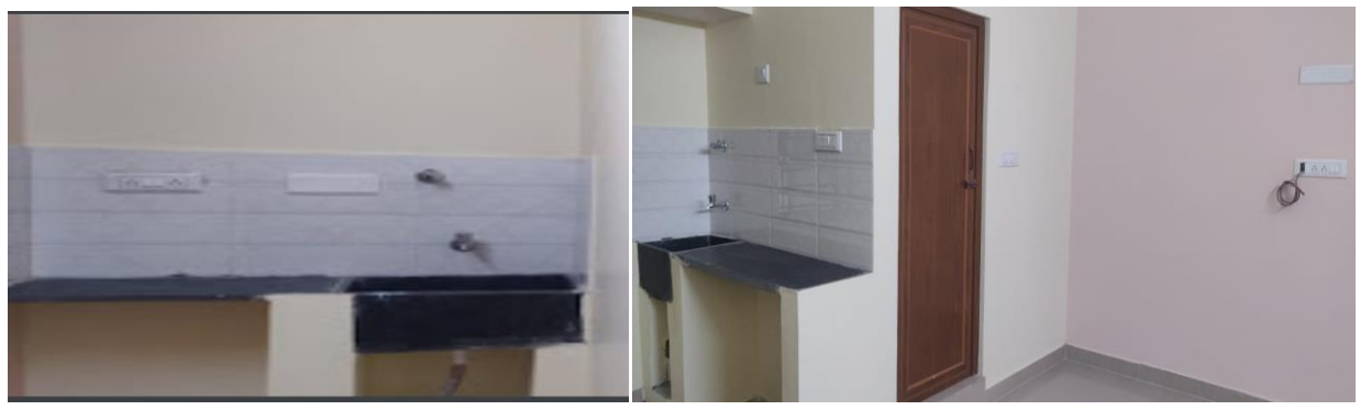
Small Kitchen Unit

Twin Sharing Rooms – with Ward Robe, attached Kitchen and Toilets