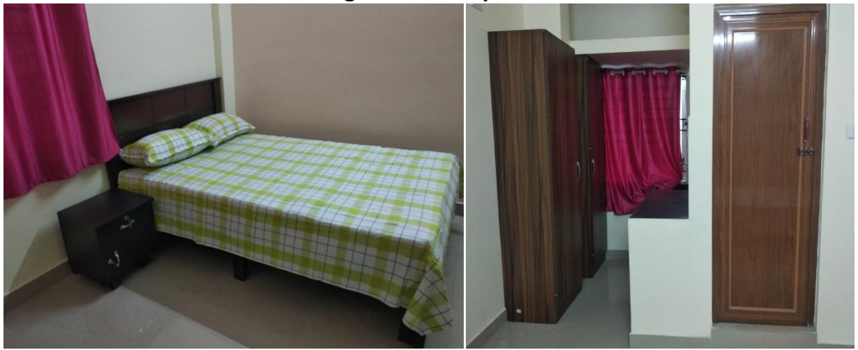
Single Room – Ordinary