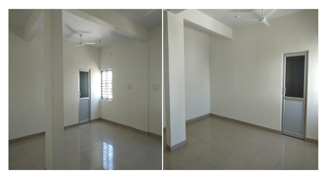
High Speed Stainless Steel Lift