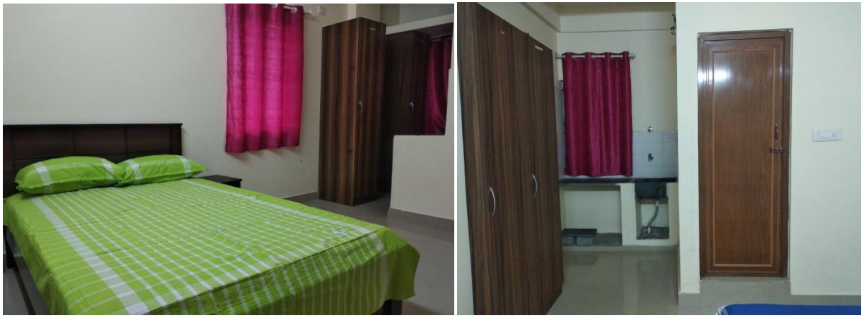
Single Room – Special