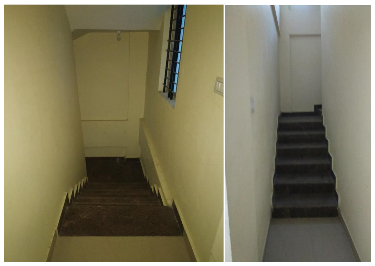
Wide Stair Cases