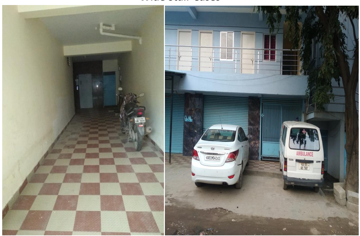
Ample Two Wheeler and 4 Wheeler Parking Spaces